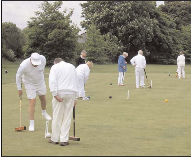
This year's first EACF League match was against Chelmsford - here all eight players have just started the first series of matches. See report for what happened and who won.

September, and doubtless we will face much tougher opposition. As always, the match was played in a fine and sporting spirit.