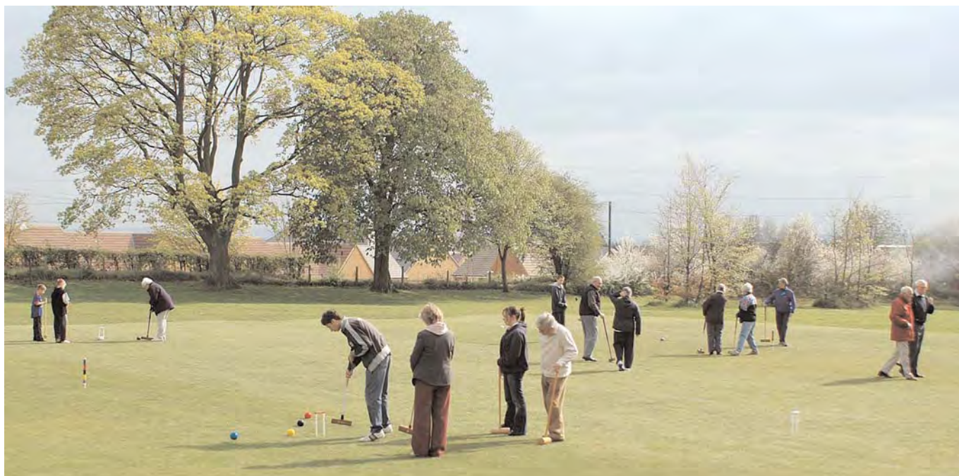
This year's Come and Try Day on 30th April was our most successful for years - the notices around the town and announcements at Page's Park Station as the trains returned from Stonehenge Works, brought us a continual flood of 'tryers' for most of the afternoon - and at one stage there was quite a queue. It was excellent to see a large number of younger people having a go. And even better was the fact that the day resulted in a number of new members.