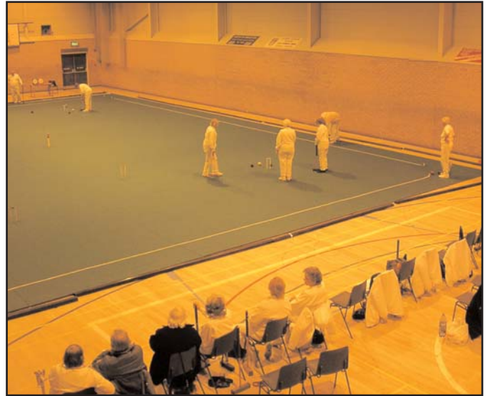
Some idea of the indoor croquet facilities at Soham, near Newmarket, which were enjoyed by six club members in early January. See report.