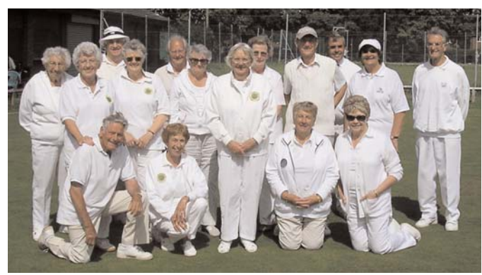
A super day both weatherwise and playing croquet with our old friends from Stony Stratford - and what's more, we won!

made us very welcome and play commenced promptly at 10.30am with us looking after our own timekeeping. This was not a problem and the games proceeded very smoothly. The courts are very smooth and beautifully looked after, however there is a marked slope across them which means that hitting from hoops 1 and 4 to 2 and 3 for example necessitates allowing between 18ins to 36ins offset! Obviously a considerable home advantage and it takes at least one game to learn the courts - and each court is also slightly different. No excuses though as Northampton played very well and very fairly with not one foul shot attempted during the entire day. They also had relevant handicaps. John and Len halved their singles matches, David scored one. The overall result was a win for Northampton by 13-5.