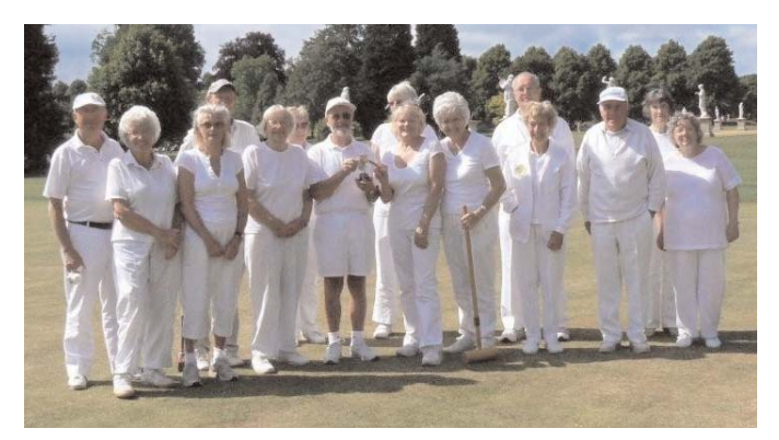
Wrest Park Singles and right, Doubles events at which LLCC members were successful. Reports below.